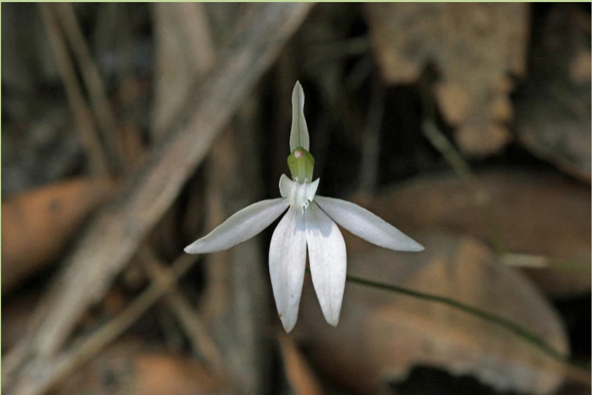
Petalochilus catenatus – White Fingers