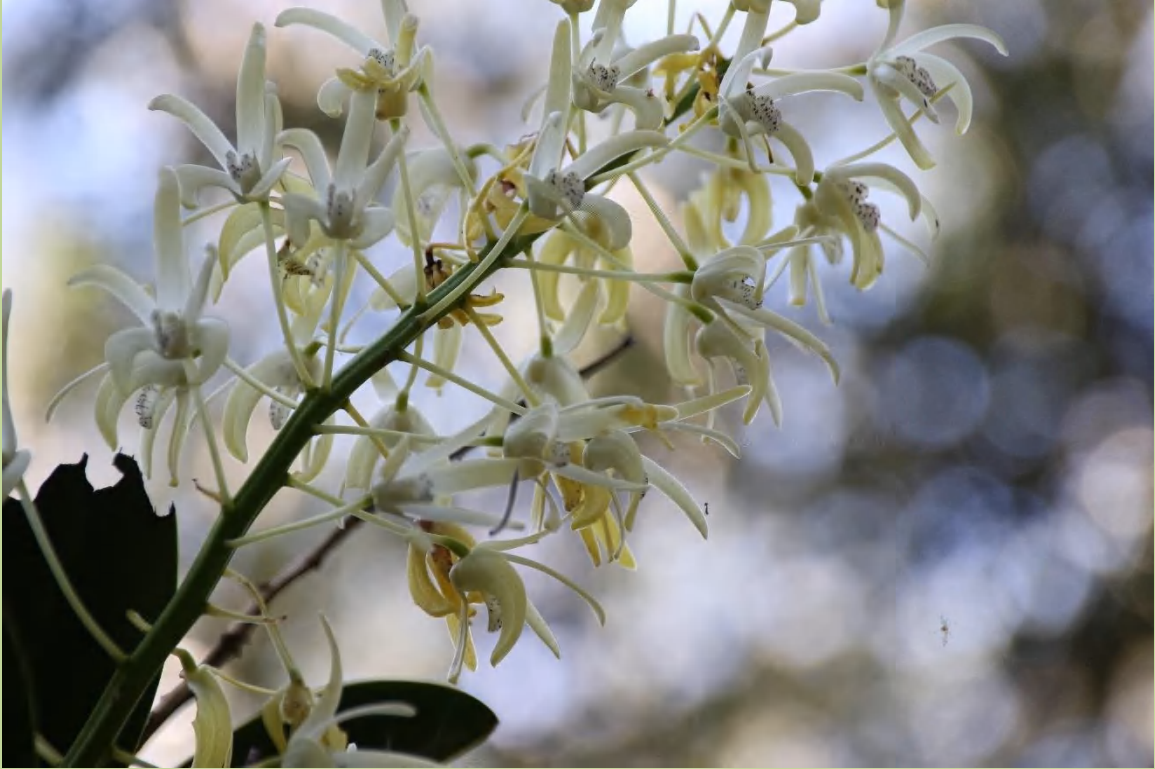
Dendrobium speciosum – Rock Orchid