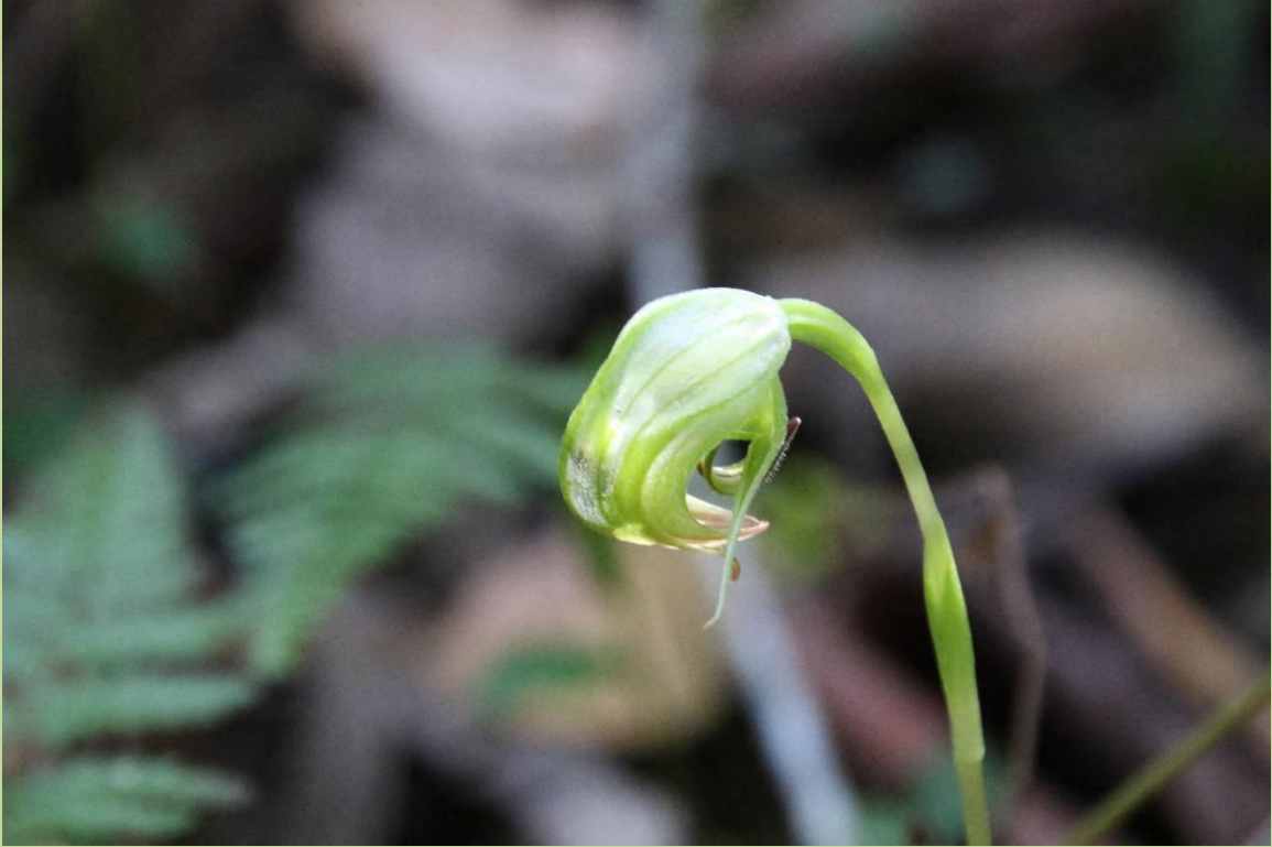
Pterostylis nutans – Nodding Greenhood