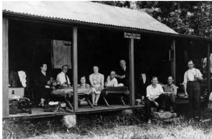
Image 2: The Zoologists Hut (AKA 'The Scientists Hut' and 'The Bird Hut') built in 1924 and destroyed in 1943. Note the car on the extreme right. Photo unknown date. 8

in overseas journals attracting worldwide interest. The Society also reported to the Trust on the status of other birds such as the Lyre Bird. The hut met an ignominious end. During WW2, with the hut unused, a series of raids by thieves stole much of the huts furniture and fabric, including locks, weatherboards, and windows, as a result, it was abandoned with plans to construct a more permanent building when the war was over. 2 Given the nature of the items stolen likely culprits would be the owners of the nearby coastal shacks at Garie, Era and Burning Palms looking to improve their shacks during a time when the availability of building material was limited by the war.