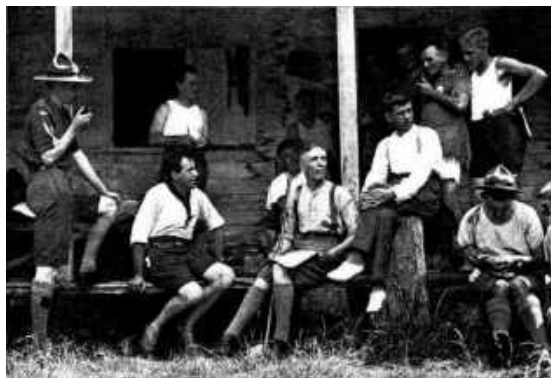
(Newspaper caption reads) The State Governor (Sir Philip Game) at the Bird Hut in National Park

Not much is known about the hut. It consisted of 2 rooms of unknown size. Images 2 and 3 suggest weatherboard construction on stone piers with a galvanised steel roof with a fireplace to provide warmth and cooking facilities. It is located only 20m from idyllic, perennial Waterfall Creek which would have provided drinking and washing water. Its visitors would probably have been troubled by mosquitoes and leeches (modern archaeologists certainly were) but its location in a mature rainforest on the edge of a clearing would be ideal for ornithological investigations. Image 6 shows its location.