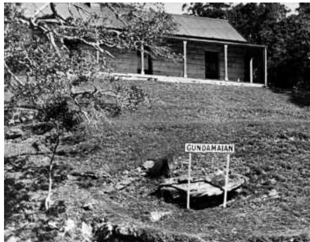
Image 1: Gundamaian cottage. Erected in 1906 and destroyed by fire in September 1961 - photo 1937. 7

The Acclimatisation Society was founded in France in 1854 and was inaugurated in NSW in 1861. 3 This society had the stated aim of introducing and acclimatising foreign species into overseas countries including the Royal National Park in NSW. The Park Trustees actively encouraged their efforts. An article entitled The Acclimatisation Society and the Royal National Park has appeared in this Bulletin. 4 In 1879 The Acclimatisation Society changed its name to the Zoological Society (later the Royal Zoological Society) and gradually changed its aims from introducing ecological disastrous and dangerous species into NSW and adopted a mission to study and conserve Australia's unique native fauna. 5,6 Initially a cottage at Gundamaian on the banks of the Hacking River, was built by the Park trustees and used for scientific purposes by the Society until 1932 when they were expelled for "inappropriate behaviour". This cottage, since destroyed, is shown in Image 1. 7