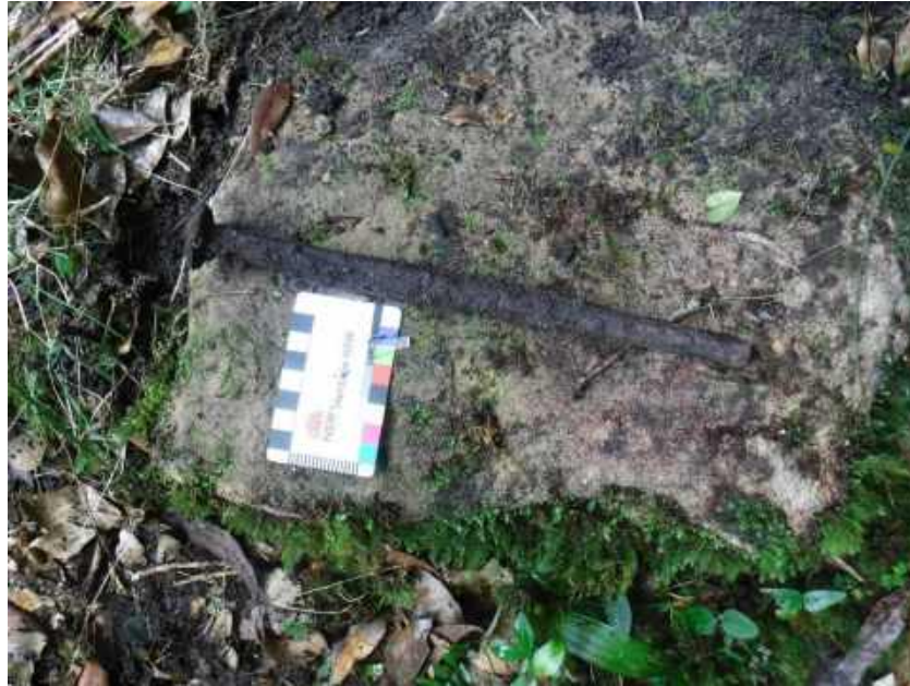
Image 4: One of the three huts' stone footings located with a large bolt and a small piece of thin window glass.