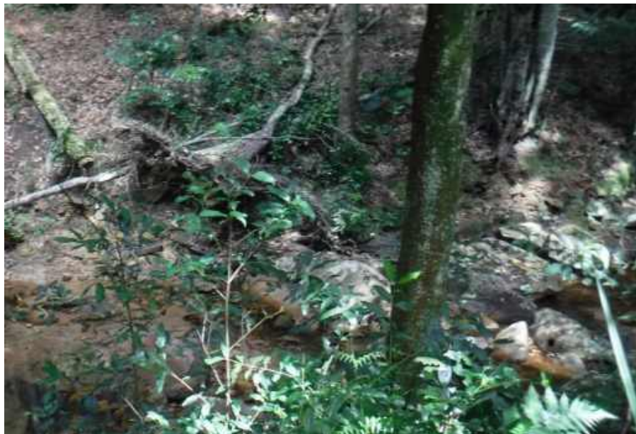
Image 5: Rocks at Nth end of hut. Possible chimney and fireplace tumble